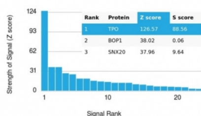
Human Protein Microarray Specificity Validation

Analysis of HuProt(TM) microarray containing more than 19,000 full-length human proteins using TPO antibody. These results demonstrate the foremost specificity of the TPO/3698 mAb. Z- and S- score: The Z-score represents the strength of a signal that an antibody (in combination with a fluorescently-tagged anti-IgG secondary Ab) produces when binding to a particular protein on the HuProt(TM) array. Z-scores are described in units of standard deviations (SD's) above the mean value of all signals generated on that array. If the targets on the HuProt(TM) are arranged in descending order of the Z-score, the S-score is the difference (also in units of SD's) between the Z-scores. The S-score therefore represents the relative target specificity of an Ab to its intended target.