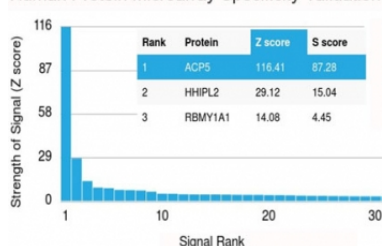
Human Protein Microarray Specificity Validation

Analysis of HuProt(TM) microarray containing more than 19,000 full-length human proteins using recombinant TRAcP antibody (clone rACP5/1070). These results demonstrate the foremost specificity of the rACP5/1070 mAb. <BR> Z- and S- score: The Z-score represents the strength of a signal that an antibody (in combination with a fluorescently-tagged anti-IgG secondary Ab) produces when binding to a particular protein on the HuProt(TM) array. Z-scores are described in units of standard deviations (SD's) above the mean value of all signals generated on that array. If the targets on the HuProt(TM) are arranged in descending order of the Z-score, the S-score is the difference (also in units of SD's) between the Z-scores. The S-score therefore represents the relative target specificity of an Ab to its intended target.