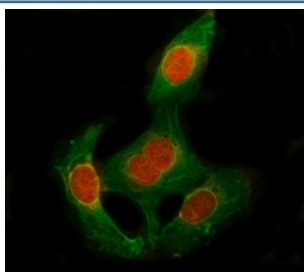
Immunofluorescent staining of FFPE human U-2 OS cells with PA26 antibody (red) and Beta Tubulin mAb (green). HIER: steam section in pH6 citrate buffer for 20 min.