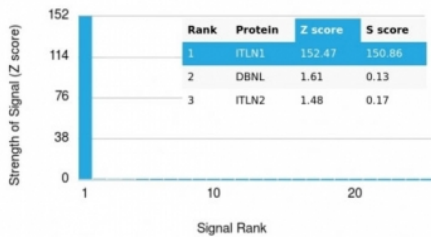
Human Protein Microarray Specificity Validation

Analysis of HuProt(TM) microarray containing more than 19,000 full-length human proteins using ITLN1 antibody. These results demonstrate the foremost specificity of the ITLN1/4064 mAb. Z- and S- score: The Z-score represents the strength of a signal that an antibody (in combination with a fluorescently-tagged anti-IgG secondary Ab) produces when binding to a particular protein on the HuProt(TM) array. Z-scores are described in units of standard deviations (SD's) above the mean value of all signals generated on that array. If the targets on the HuProt(TM) are arranged in descending order of the Z-score, the S-score is the difference (also in units of SD's) between the Z-scores. The S-score therefore represents the relative target specificity of an Ab to its intended target.