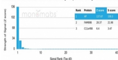
Human Protein Microarray Specificity Validation

Analysis of HuProt(TM) microarray containing more than 19,000 full-length human proteins using Haptoglobin antibody (clone HP/3840). These results demonstrate the foremost specificity of the HP/3840 mAb. Z- and S- score: The Z-score represents the strength of a signal that an antibody (in combination with a fluorescently-tagged anti-IgG secondary Ab) produces when binding to a particular protein on the HuProt(TM) array. Z-scores are described in units of standard deviations (SD's) above the mean value of all signals generated on that array. If the targets on the HuProt(TM) are arranged in descending order of the Z-score, the S-score is the difference (also in units of SD's) between the Z-scores. The S-score therefore represents the relative target specificity of an Ab to its intended target.