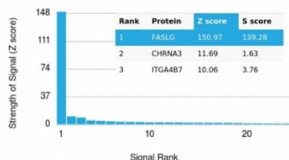
Human Protein Microarray Specificity Validation

Analysis of HuProt(TM) microarray containing more than 19,000 full-length human proteins using Fas Ligand antibody (clone FASLG/4455). These results demonstrate the foremost specificity of the FASLG/4455 mAb. Z- and S- score: The Z-score represents the strength of a signal that an antibody (in combination with a fluorescently-tagged anti-IgG secondary Ab) produces when binding to a particular protein on the HuProt(TM) array. Z-scores are described in units of standard deviations (SD's) above the mean value of all signals generated on that array. If the targets on the HuProt(TM) are arranged in descending order of the Z-score, the S-score is the difference (also in units of SD's) between the Z-scores. The S-score therefore represents the relative target specificity of an Ab to its intended target.