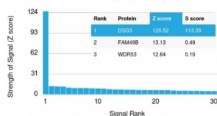
Human Protein Microarray Specificity Validation

Analysis of HuProt(TM) microarray containing more than 19,000 full-length human proteins using Desmoglein 3 antibody (clone DSG3/2796). These results demonstrate the foremost specificity of the DSG3/2796 mAb. Z- and S- score: The Z-score represents the strength of a signal that an antibody (in combination with a fluorescently-tagged anti-IgG secondary Ab) produces when binding to a particular protein on the HuProt(TM) array. Z-scores are described in units of standard deviations (SD's) above the mean value of all signals generated on that array. If the targets on the HuProt(TM) are arranged in descending order of the Z-score, the S-score is the difference (also in units of SD's) between the Z-scores. The S-score therefore represents the relative target specificity of an Ab to its intended target.