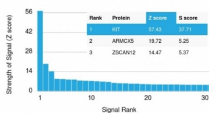
Human Protein Microarray Specificity Validation

Analysis of HuProt(TM) microarray containing more than 19,000 full-length human proteins using CD117 antibody (clone KIT/2670). These results demonstrate the foremost specificity of the KIT/2670 mAb. Z- and S- score: The Z-score represents the strength of a signal that an antibody (in combination with a fluorescently-tagged anti-IgG secondary Ab) produces when binding to a particular protein on the HuProt(TM) array. Z-scores are described in units of standard deviations (SD's) above the mean value of all signals generated on that array. If the targets on the HuProt(TM) are arranged in descending order of the Z-score, the S-score is the difference (also in units of SD's) between the Z-scores. The S-score therefore represents the relative target specificity of an Ab to its intended target.