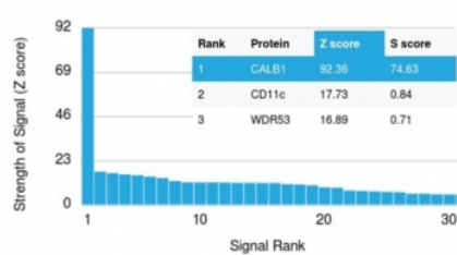
Human Protein Microarray Specificity Validation

Analysis of HuProt(TM) microarray containing more than 19,000 full-length human proteins using Calbindin antibody (clone CALB1/2782). These results demonstrate the foremost specificity of the CALB1/2782 mAb. Z- and S- score: The Z-score represents the strength of a signal that an antibody (in combination with a fluorescently-tagged anti-IgG secondary Ab) produces when binding to a particular protein on the HuProt(TM) array. Z-scores are described in units of standard deviations (SD's) above the mean value of all signals generated on that array. If the targets on the HuProt(TM) are arranged in descending order of the Z-score, the S-score is the difference (also in units of SD's) between the Z-scores. The S-score therefore represents the relative target specificity of an Ab to its intended target.