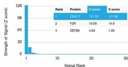
Human Protein Microarray Specificity Validation

Analysis of HuProt(TM) microarray containing more than 19,000 full-length human proteins using Cadherin 17 antibody (clone CDH17/2617). These results demonstrate the foremost specificity of the CDH17/2617 mAb. <BR>Z- and S- score: The Z-score represents the strength of a signal that an antibody (in combination with a fluorescently-tagged anti-IgG secondary Ab) produces when binding to a particular protein on the HuProt(TM) array. Z-scores are described in units of standard deviations (SD&#39;s) above the mean value of all signals generated on that array. If the targets on the HuProt(TM) are arranged in descending order of the Z-score, the S-score is the difference (also in units of SD&#39;s) between the Z-scores. The S-score therefore represents the relative target specificity of an Ab to its intended target.