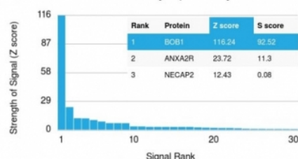
Human Protein Microarray Specificity Validation

Analysis of HuProt(TM) microarray containing more than 19,000 full-length human proteins using BOB1 antibody (clone BOB1/2421). These results demonstrate the foremost specificity of the BOB1/2421 mAb. Z- and S- score: The Z-score represents the strength of a signal that an antibody (in combination with a fluorescently-tagged anti-IgG secondary Ab) produces when binding to a particular protein on the HuProt(TM) array. Z-scores are described in units of standard deviations (SD's) above the mean value of all signals generated on that array. If the targets on the HuProt(TM) are arranged in descending order of the Z-score, the S-score is the difference (also in units of SD's) between the Z-scores. The S-score therefore represents the relative target specificity of an Ab to its intended target.